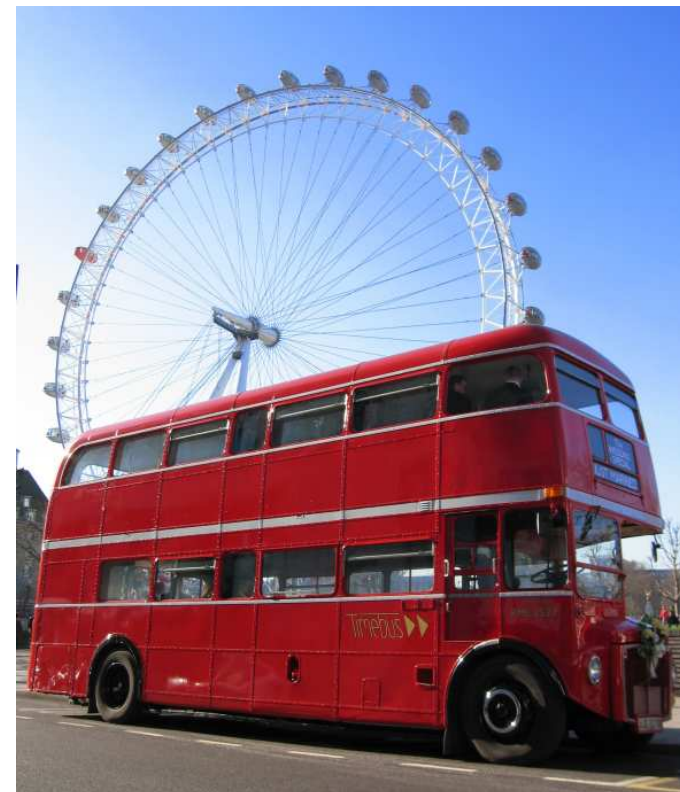
Open Platform Routemaster