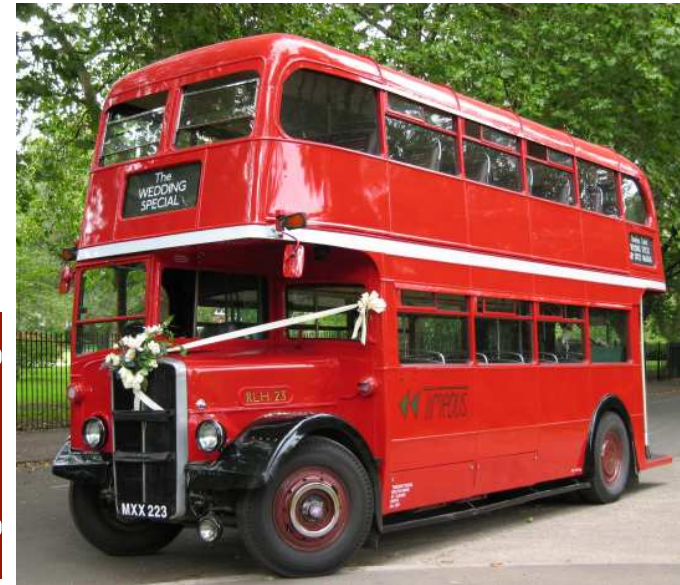
Regent Low Height

Features a more luxurious and spacious interior than other Routemasters, including overhead chrome and mesh racks for hand luggage.