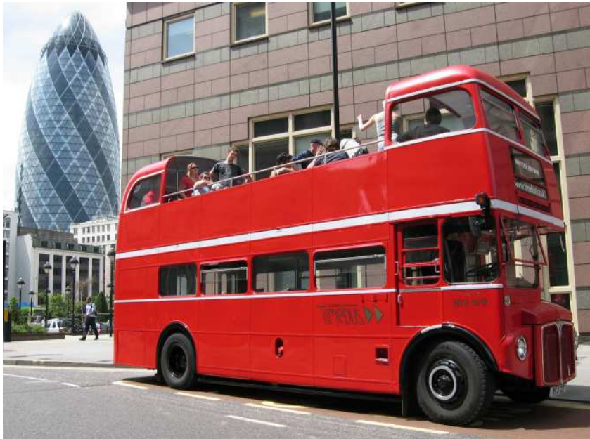
Open Topper with Doors

Seating up to 39 people on one level, the Regal Four is well suited to smaller parties. Her access is rarely limited by low tree branches, which can be a problem for double deckers in country areas.